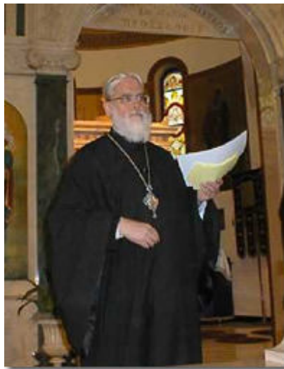
Metropolitan Kallistos (Ware) of Diokleia

Such is the role of the spiritual father. As St Barsanuphius expressed it, "I care for you more than you care for yourself."